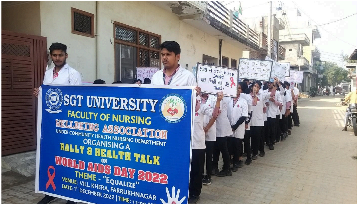
B. Sc Nursing students processing for rally

SHREE GURU GOBIND SINGH TRICENTENARY UNIVERSITY (UGC & AICTE Approved) Gurugram, Delhi-NCR