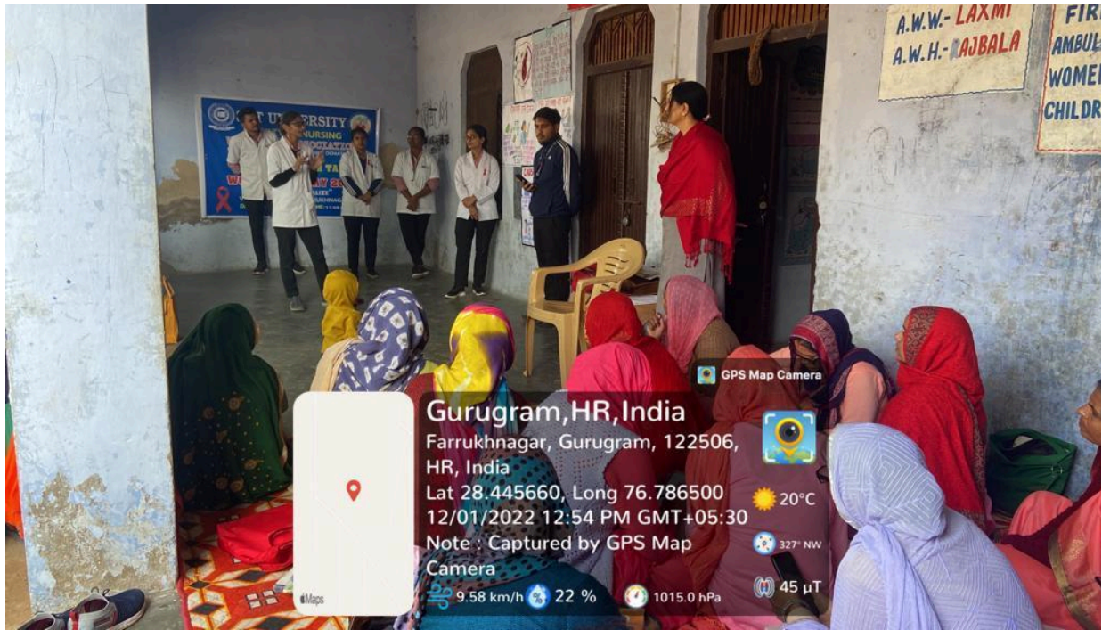
B. Sc Nursing Students delivering Health education on HIV/AIDS.